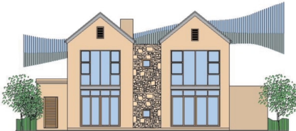
UNIT TYPE A